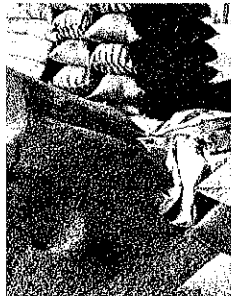
Chhattisgarh has registered a record paddy procurement in the kharif marketing season of 2023-24

"The delay is not on the part of rice millers," said one of the mill owners. The PCI