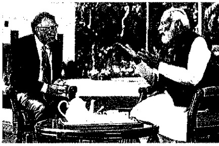
Prime Minister Narendra Modi (right) with Microsoft co-founder Bill Gates during a meeting at his residence in New Delhi.

Gates commended India's advancements in technology, particularly in AI